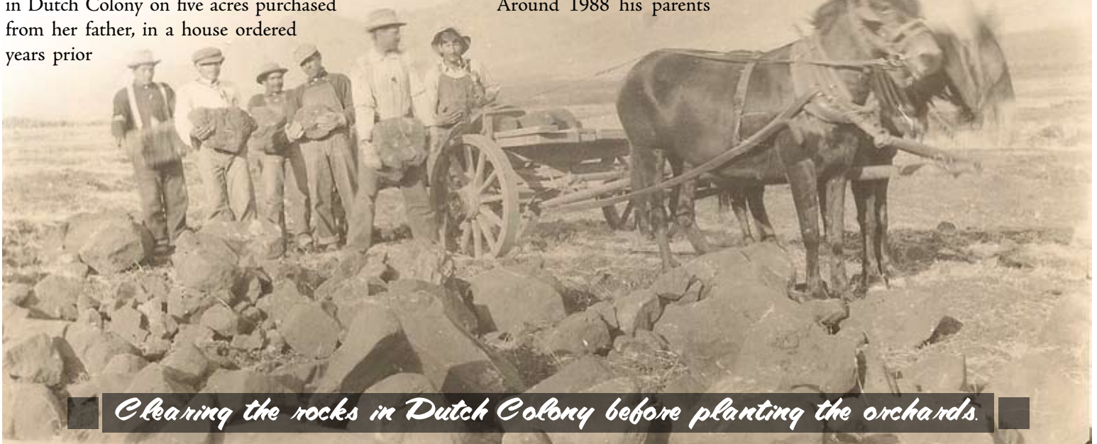
Clearing the rocks in Dutch Colony before planting the orchards.