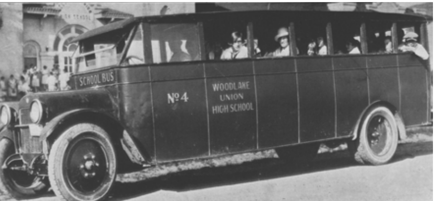
WOODLAKE HIGH SCHOOL BUS 1928